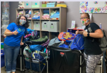
Thank you SaintA for helping us get backpacks to families

Including more than 300 fully loaded backpacks.